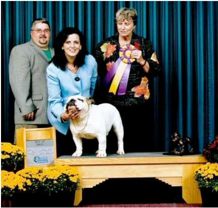
BISS CH. DOWAT'S COUNTRY RIDGE IKE HULA GIRL