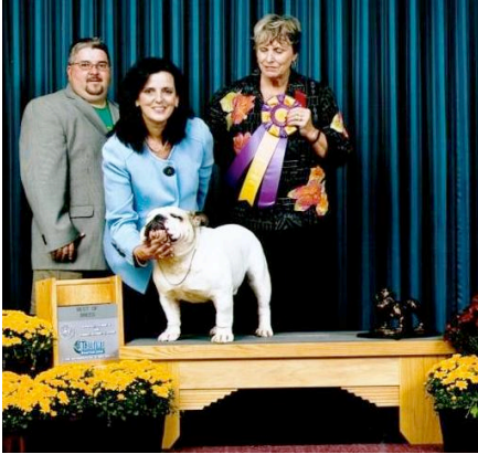
BISS CH. DOWAT'S COUNTRY RIDGE IKE HULA GIRL